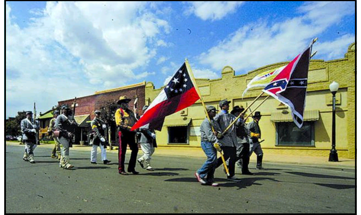
“FOOT CAVALRY” - The Color Guard and Rifle Detail “Present Arms” in front of the Elk City Daily News office near the completion of their two mile trek in the 73rd Annual Rodeo Of Champions Parade in Elk City on Sept. 3rd.