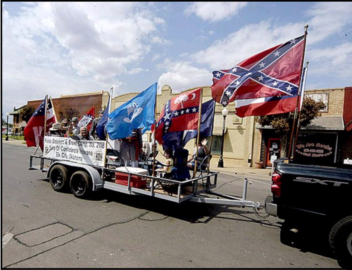
FLAGS OF OUR FATHERS - Near the end of the parade in front of the Elk City Daily News office on West Broadway. Several persons, including SCV members, their wives and children rode the trailer and were a big hit with parade watchers. On the pickup were the First National and Battle Flags. At the front of the trailer were the Secession and Bonnie Blue Flags.