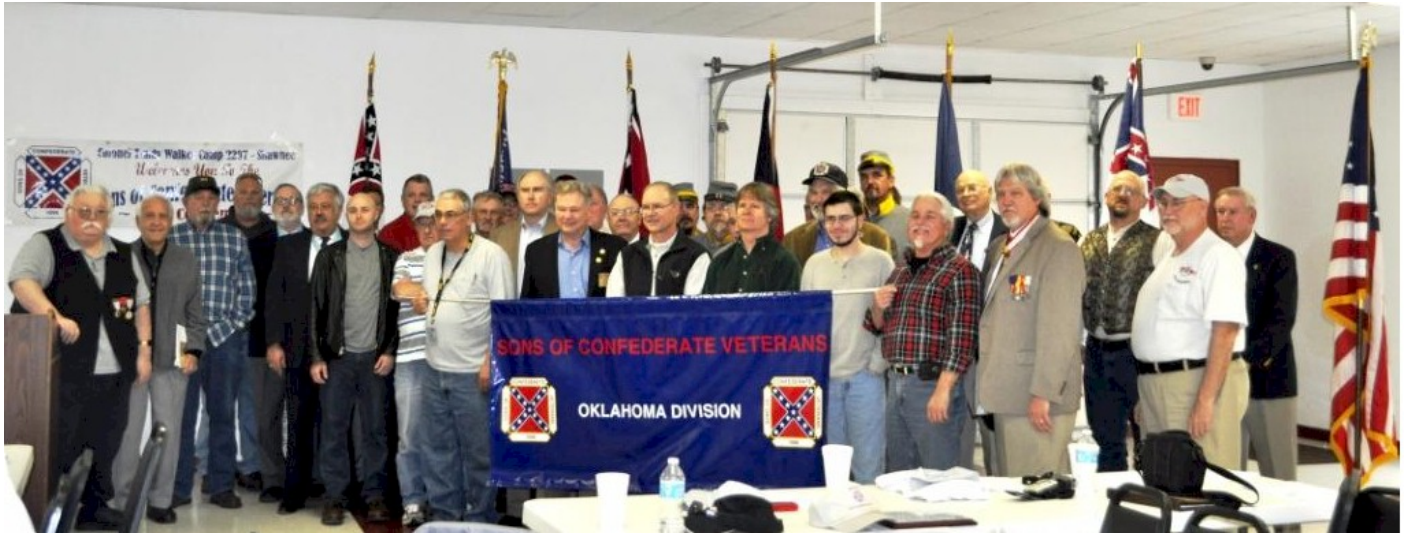
Group photo of Convention Attendees