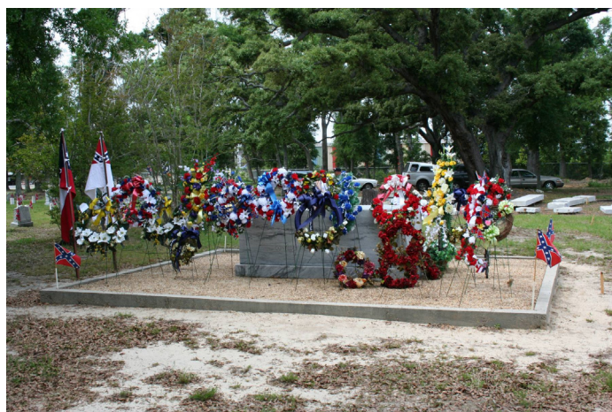
The tomb of the Unknown Confederate Soldier, located in the Confederate Cemetery on the grounds of Beauvoir, Biloxi, MS – April 27, 2013