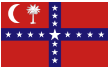
Miles' original design – the Sovereignty or Secession Flag

The most familiar and popular of all Confederate symbols is the Battle Flag. During the first Battle of Manassas, Confederate soldiers had trouble distinguishing between their flag and the stars and stripes from a distance, when the flags hung limp. General P. G. T. Beauregard wrote that he was "resolved then to have [our flag] changed if possible, or to adopt for my command a 'Battle flag', which would be entirely different from any State or Federal flag." One of his aides, William Porcher Miles, the former chairman of the Congressional Committee on the Flag and Seal, described his rejected national flag design to Beauregard. Miles also told the Committee on the Flag and Seal about the general's complaints and request for the national flag to be changed. The Committee rejected this idea by a four to one vote, after which Beauregard proposed the idea of having two flags. He described the idea in a letter to his commander General Joseph E. Johnston: "I wrote to [Miles] that we should have two flags—a peace or parade flag, and a war flag to be used only on the field of battle—but Congress having adjourned no action will be taken on the matter—How would it do us to address the War Dept. on the subject of Regimental or badge flags made of red with two blue bars crossing each other diagonally on which shall be introduced the stars, ... We would then on the field of battle know our friends from our Enemies."