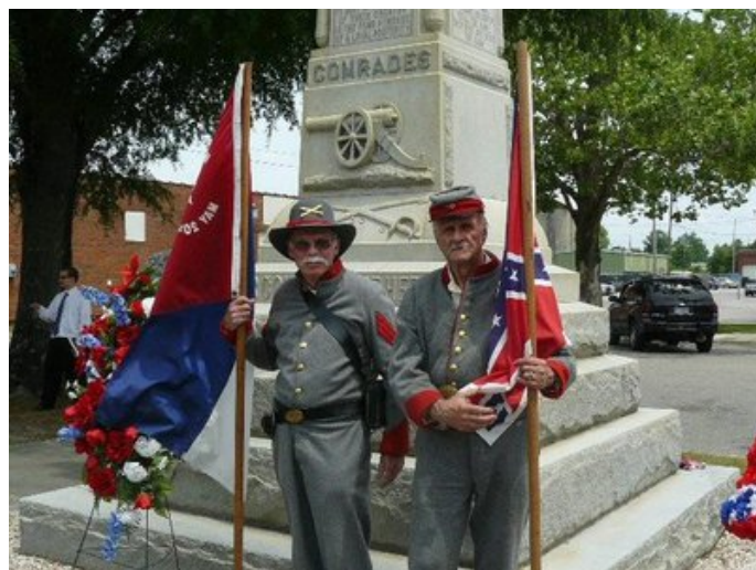
Laurinburg, NC – May 11, 2013