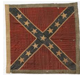
The square design approved by General Joseph E. Johnston