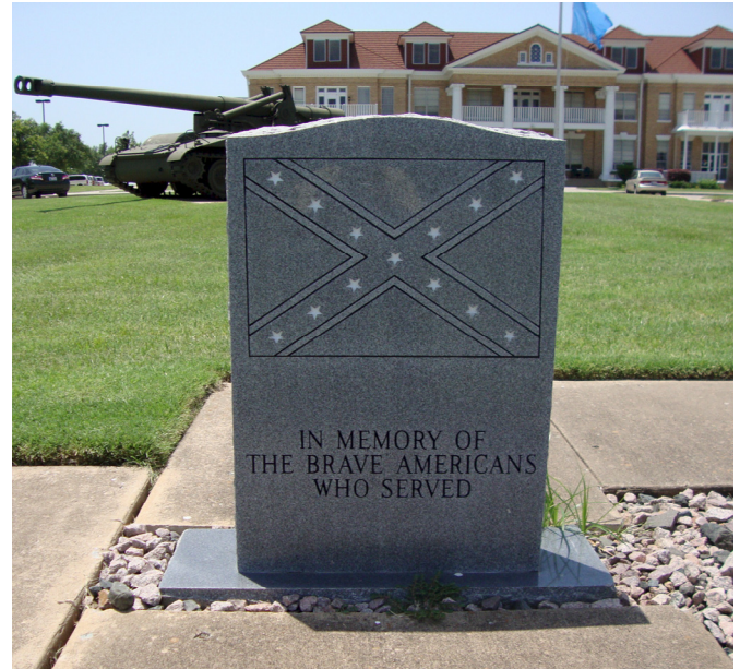
Confederate Memorial at the Ardmore Veterans Center, originally the Confederate Soldiers Home