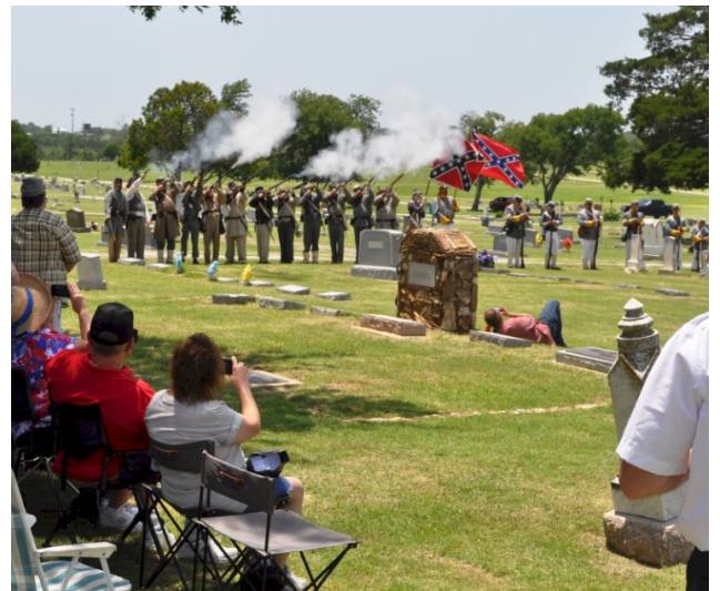
Captain Clem Vann Rogers Color Guard, Oklahoma City, 16 th Arkansas Infantry, Joe Wright Guards