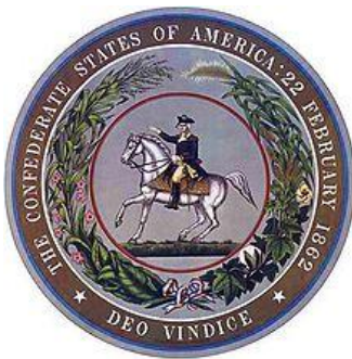
Colorized version of the Great Seal of the Confederate States of America

Both sets of artifacts ultimately entered museum collections. The dies now reside in the Museum of the Confederacy in Richmond. The embossing press, equipped with brass replica dies, is in the National Trust Museum in St. George's, Bermuda.