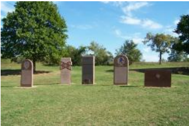
Honey Springs Battlefield Monuments

Friday, November 8, will be an education day for students. Battle reenactments will be held Saturday and Sunday. The re-enactment is sponsored by the Oklahoma Historical Society.