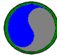
The shoulder sleeve insignia of the 29 th "Blue and Gray" Infantry Division

After Normandy, the Stonewall Brigade and the rest of the 29 th Division saw combat in Brittany, where it participated in the fighting for Brest. The division was then sent to the Siegfried Line, where it was the first division to cross the Roer River. In February, the 29 th crossed the Rhine, and finally on May 2, 1945, it linked up with elements of the Soviet army near Torgau on the Elbe River. The original compliment of the 29 th Division was about 14,400 men. From Omaha Beach to the Elbe, the Division suffered 19,814 killed, wounded and missing, almost 140 per cent casualties.