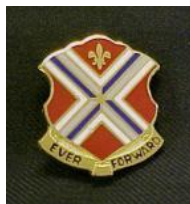
The regimental crest of the 116 th Infantry Regiment

With the end of the War, the Virginia militia was temporarily dissolved. During the period, 1871-1881, elements of the old brigade were reorganized as independent infantry companies in the Shenandoah Valley. Over the next several years, these units were reorganized and re-designated several times. On June 3, 1916, they were incorporated into the Virginia National Guard as the 2 nd Virginia Infantry. In 1917, First, Second, and Fourth Virginia Regiments were combined to form the 116 th Infantry Regiment and were joined with Guard units from Maryland, Delaware, Pennsylvania, New Jersey and the District of Columbia to form the 29 th Infantry Division, the Blue and Gray Division. The 29 th Division saw extensive combat in France during World War I. It was there that the 116 th Infantry earned its motto, "Ever Forward", for never giving up ground once gained.