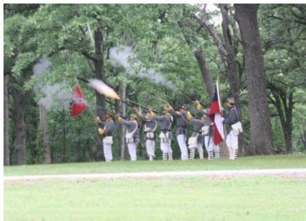
Color Guard – Shelby's Iron Men of Duncan