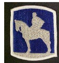
The shoulder sleeve insignia of the 116 th Infantry BCT, "Stonewall Brigade", 29 th Infantry Division, Virginia National Guard

Most recently the 116 th has served in Kosovo, Iraq and Afghanistan. In 2006, the Army re-designated the 1 st Brigade, as the 116 th Infantry Brigade Combat Team (BCT), 29 th Infantry Division. Recognizing the brigade's heritage, Virginia's government once again re-designated the 116 th Infantry BCT, as the Stonewall Brigade, and authorized the brigade's shoulder sleeve insignia, modeled on the Stonewall Jackson monument located on the Manassas battlefield. The distinctive brigade shoulder sleeve insignia is no longer worn by brigade members. They now wear the insignia of the 29 th Infantry Division.