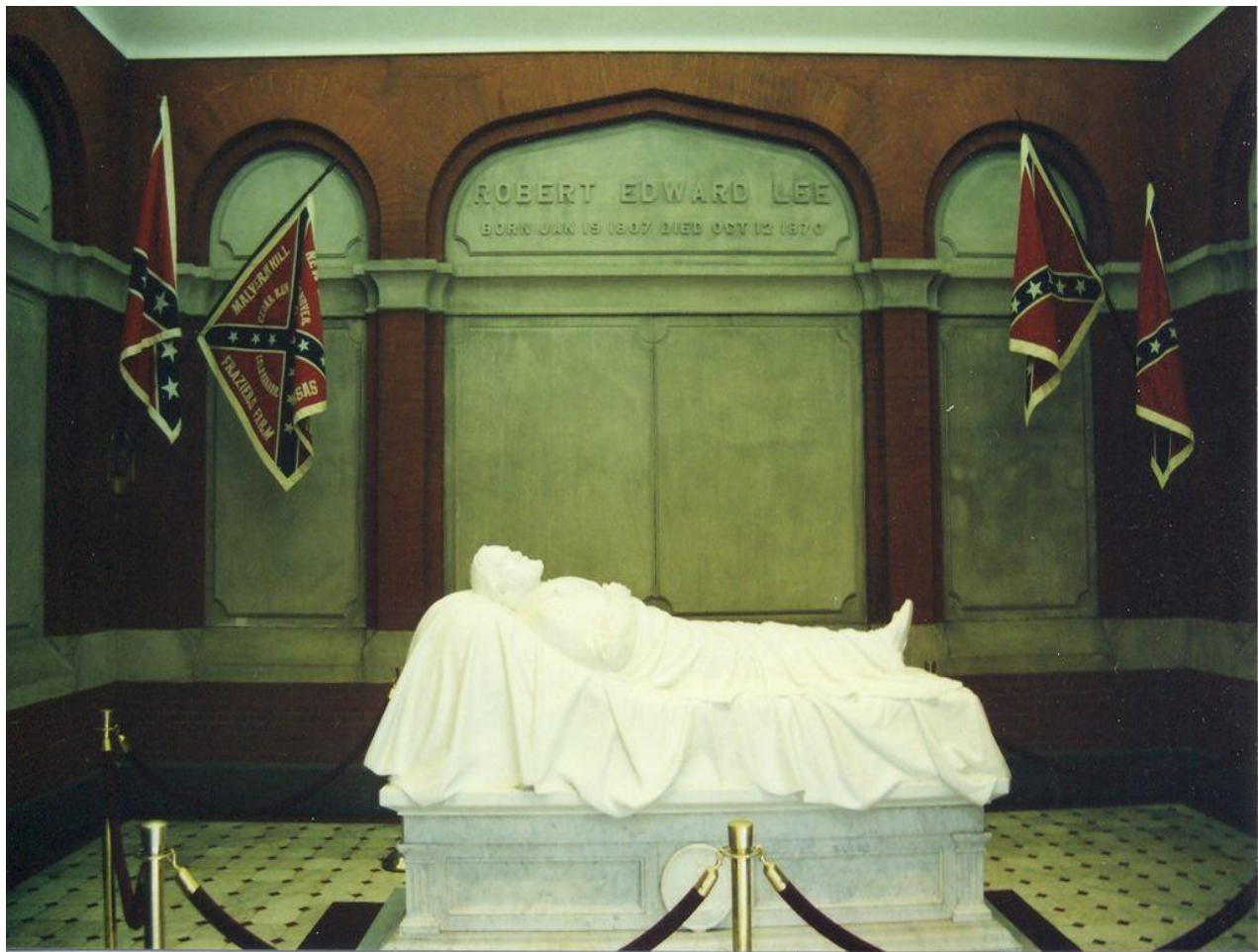
"Recumbent Statue" of Robert E. Lee asleep on the battlefield, located in Lee Chapel