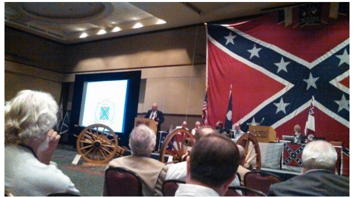
119 th SCV Reunion