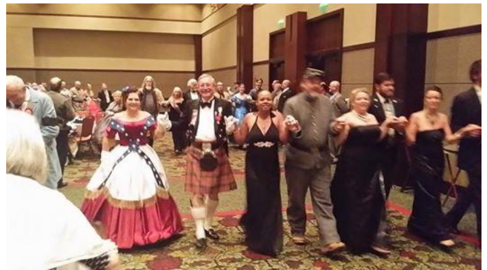
The Reunion ball