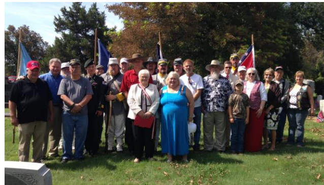
Attendees of the Confederate Memorial Day service at Fairlawn Cemetery.