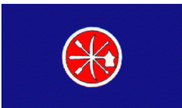
Choctaw Battle Flag