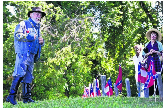
East Hill Cemetery, Bristol, TN – May 24, 2015