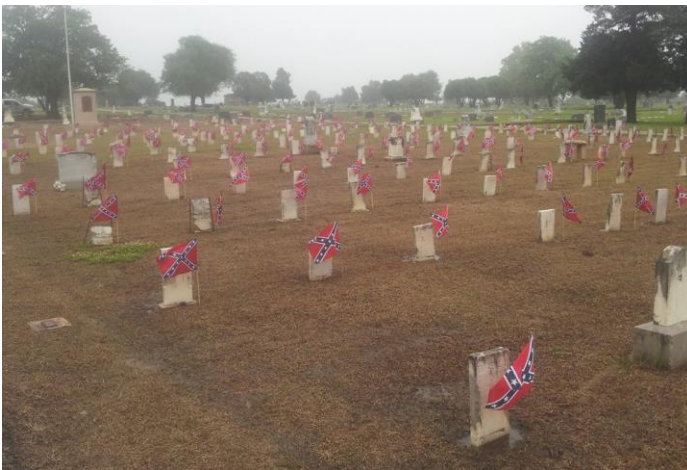
Front and rear views of the Confederate Section of Rose Hill Cemetery, Ardmore – May 25, 2015