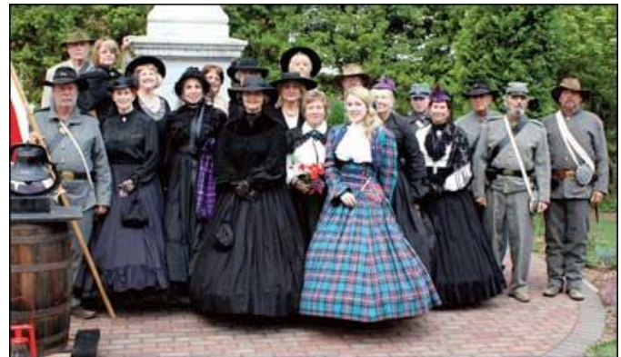
Macon, GA – May 8, 2014