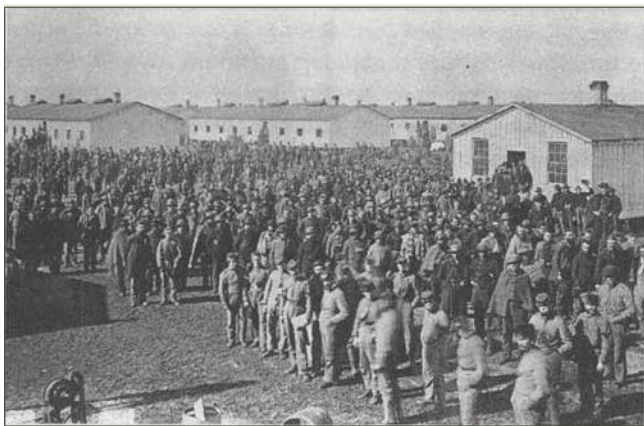
The infamous Union POW Camp Douglas near Chicago, where 4,275 Confederate prisoners died.

Note: General Lee informed General Grant that Confederate cavalrymen and artillerymen furnished their own horses or mules, and asked if the agreement allowed them to keep the animals. Grant replied that it did not, and that he was unaware of that situation. He told General Lee that he would instruct the parole officers that any man who claimed ownership of a horse or mule would be allowed keep it. The Appomattox surrender terms would serve as a model for future surrenders.