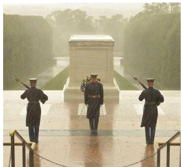
Duty and Fidelity at the Tomb of the Unknown Soldier Memorial Day at Arlington National Cemetery