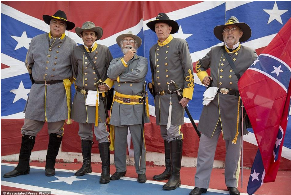
Meet Brazil's 'Confederados': They've forgotten how to speak English but the South American descendants of rebels who fled the US after the Civil War still turn out by the thousands to celebrate their Dixie roots. Descendants of American Southerners wearing Confederate-era uniforms pose for pictures as they attend a party to celebrate the 150 th anniversary of the end of the American Civil War in Santa Barbara d'Oeste, Brazil on Sunday, April 26.

The Southern Advocate is the voice of the Oklahoma Division of the Sons of Confederate Veterans, a non-profit organization of patriotic, historical, sectional and genealogical orientation, as a service to its Compatriots and their friends. Opinions reflect the views of the writers and are not necessarily a statement of the Division, SCV or their policies. Contents may be reproduced only when in the best interest of the SCV. Please direct articles, photos, comments, suggestions, etc. to the Editor at khcook@cox.net .