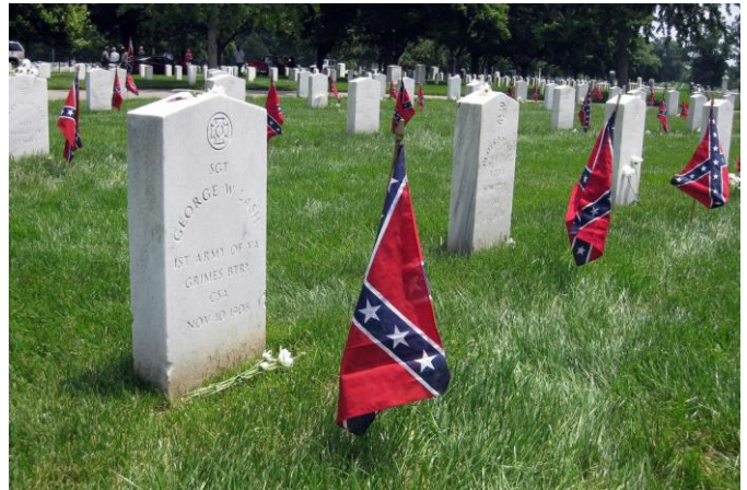
Confederate Section of Arlington National Cemetery – April 27, 2015.