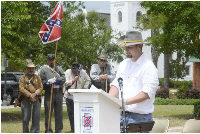
Orangeburg, SC – May 16, 2015