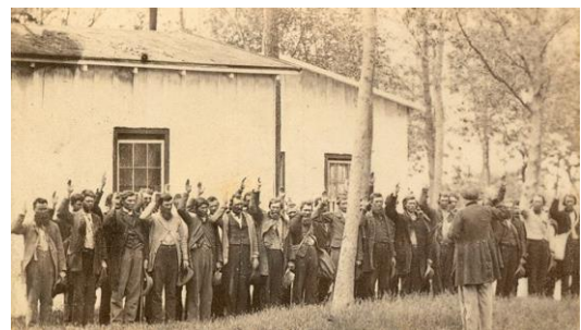
Confederate prisoners of war taking the oath of allegiance to the United States at Rock Island prison – Galvanized Yankees.

Union officials offer the oath of allegiance to captured Confederate soldiers at Rock Island Prison Barracks in Illinois. Those who took the oath were called Galvanized Yankees because their loyalty was about as thick as the zinc on galvanized iron. The Galvanized Yankees were put into the Union Navy or sent to forts in the far West.