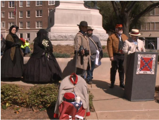
State Capitol, Little Rock, AR – April 4, 2015