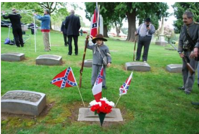
Portland, OR – April 26, 2015