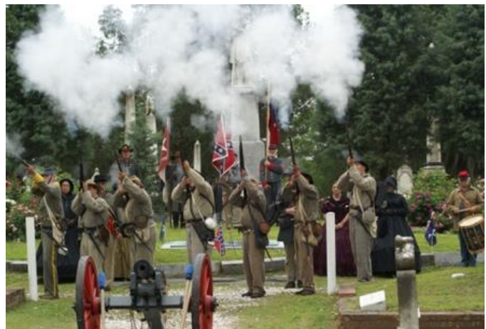
Cedar Grove Cemetery, New Bern, NC – May 10, 2015