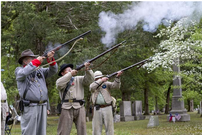
St. Luke's Episcopal Church Cemetery, Courtland, VA – April 26, 2015