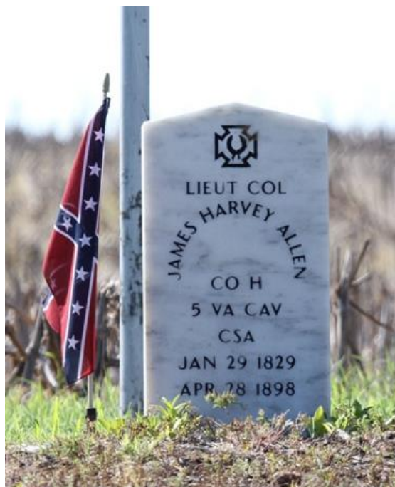
Camp James City Cavalry of Williamsburg, VA held its 2015 Confederate Memorial Day service at Peach Creek Cemetery, Toano, VA, on May 23.

For additional information go to Page 55 of the September-October issue of Confederate Veteran .