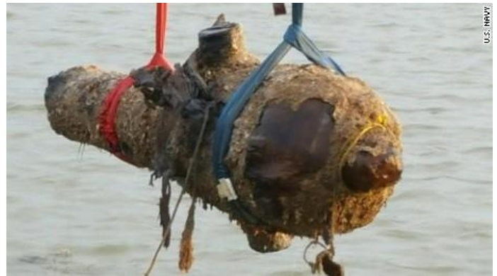
A gun tube raised from CSS Georgia wreck site

Archaeologists and the Navy were surprised so much timber remained with the iron rails making up the casemate. They tried a couple of approaches before fashioning a device resembling a guillotine to cut through the armor and wood. Sections weighing about 10,000 pounds are then lifted to the surface.