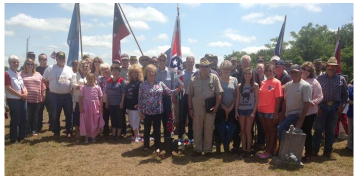
Most of the attendees (some had to leave) who attended the Naples Cemetery Confederate Memorial Day service

(Report of the Confederate Memorial Day service, photos and following newspaper article courtesy of Camp Adjutant Larry Logan.)