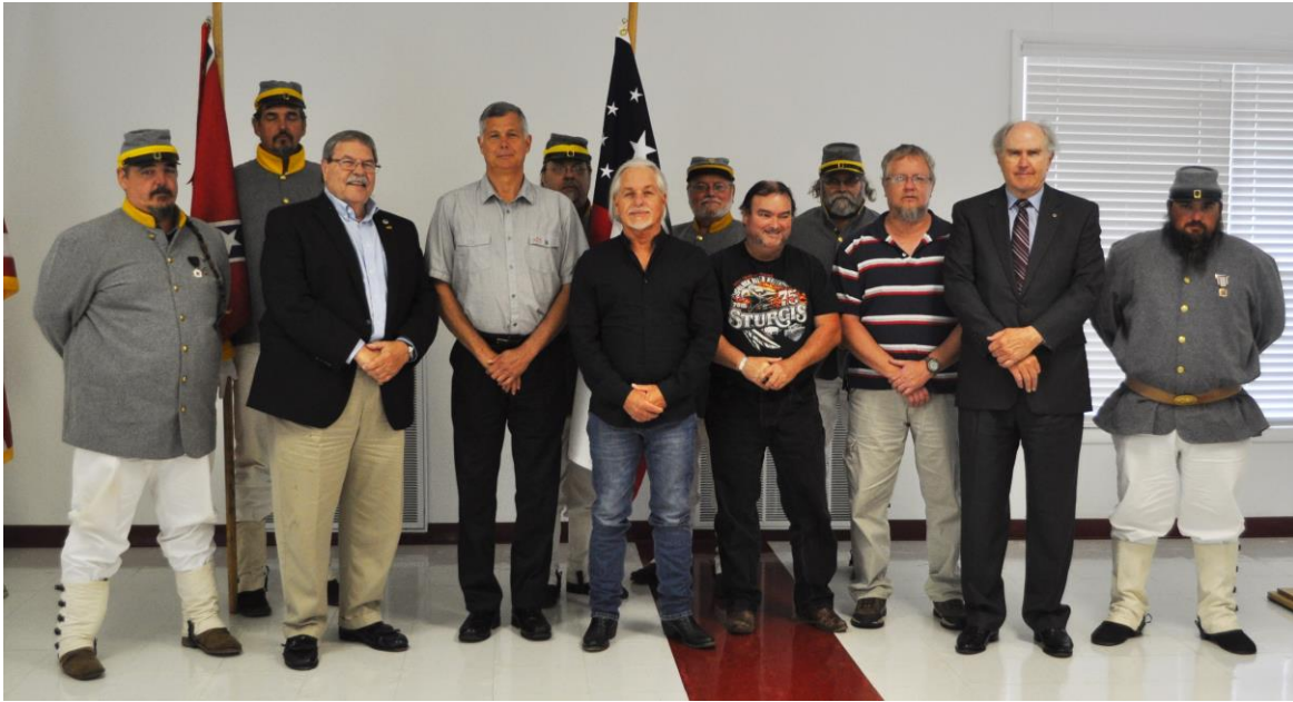
2016-18 Oklahoma Division officers and Brigade Commanders with the Division Color Guard