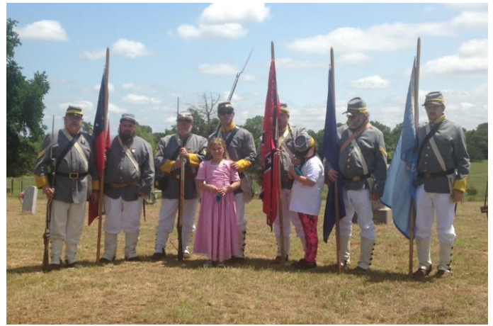
The Color Guard and two of their children