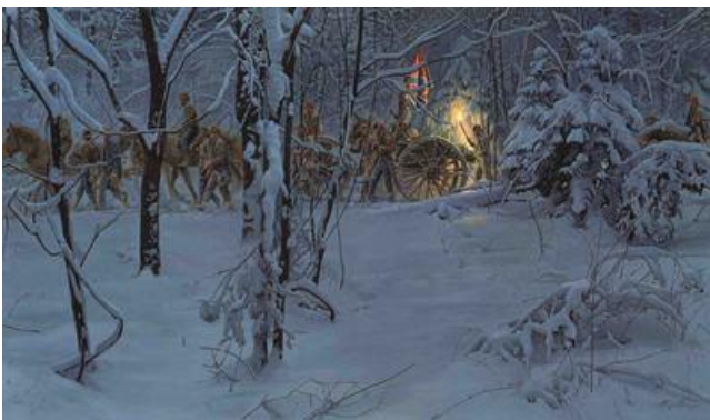
Confederate Christmas by Mort Künstler