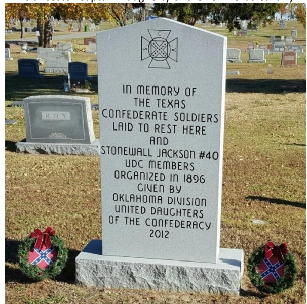
Oak Hill Cemetery – McAlester