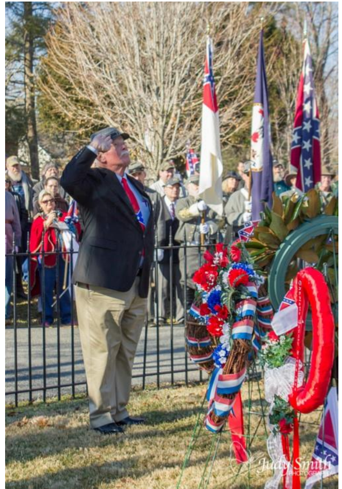
Virginia Flaggers at the grave of Stonewall Jackson