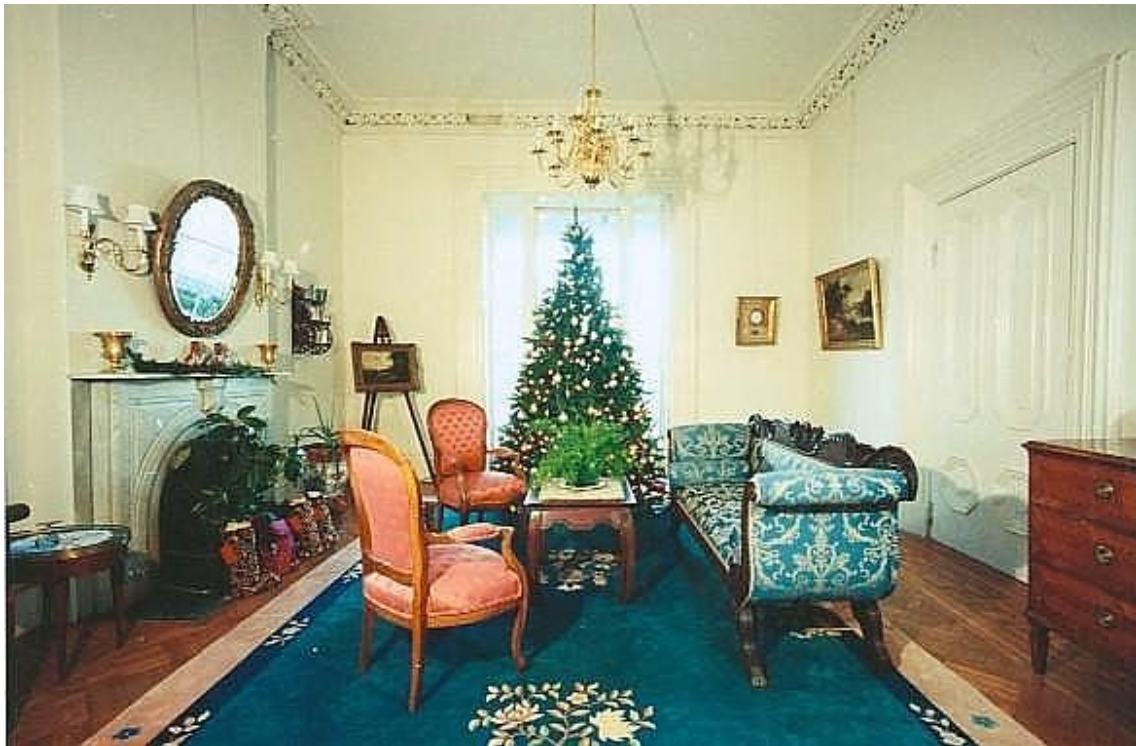
The Music Room of the Confederate White House – Richmond