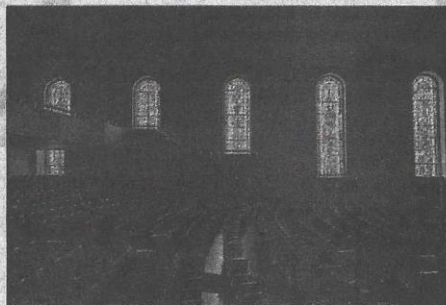
Stained glass windows are featured in Raley Chapel on the campus of Oklahoma Baptist University in Shawnee.

Once I did talk to two members of the group, they did have viewpoints