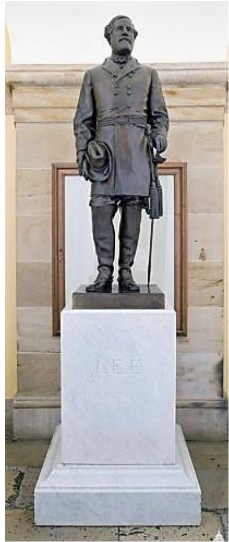
Statue of General Robert E. Lee – Statuary Hall – U.S. Capitol Placed by the Commonwealth of Virginia in 1909

True to our traditions of peace and our love of justice, we sent commissioners to the United States to propose a fair and amicable settlement of all questions of public debt or property which might be in dispute. But the Government at Washington, denying our right to self-government, refused even to listen to any proposals for a peaceful separation. Nothing was then left to do but to prepare for war”.