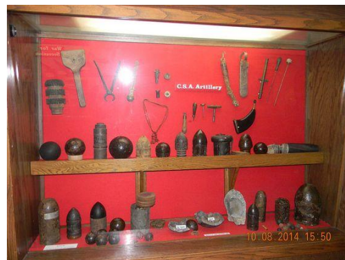
Confederate Artillery – 45 th Infantry Division Museum Oklahoma City