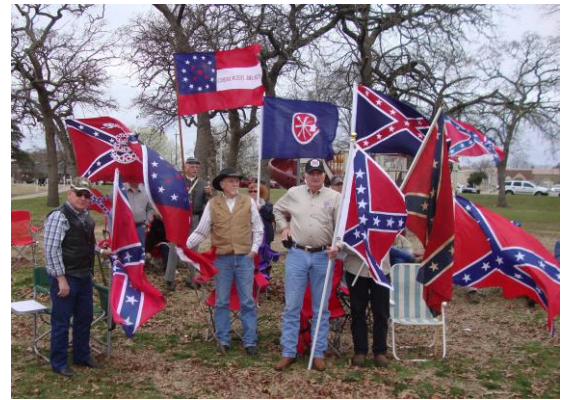
Members of Camp Capt. James J. McAlester proudly displaying their Confederate flags