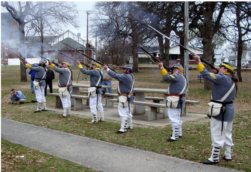
Indian Nations/Red River Brigade Color Guard