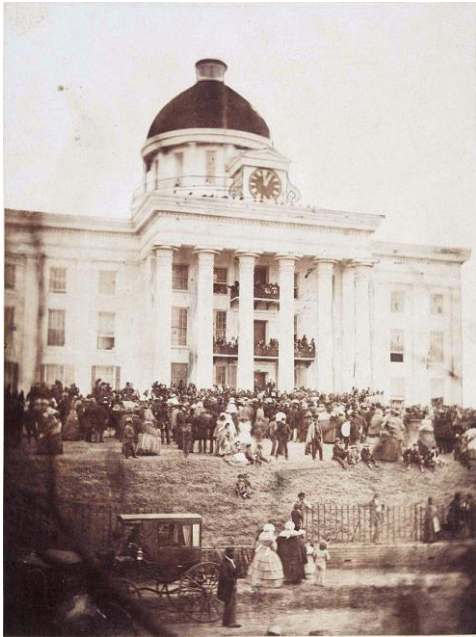
Inauguration of Jefferson Davis as Provisional President of the Confederate States of America – Alabama State Capitol – February 18, 1861.