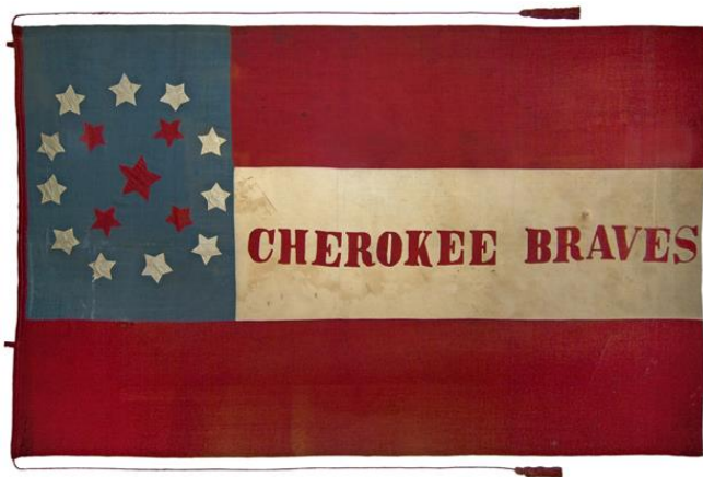
1 st Cherokee Mounted Rifles regimental flag designed by Albert Pike. The original flag was lost in the Battle of Old Fort Wayne.

What remained of Drew's Regiment was folded into Watie's regiment and reorganized as the 1 st Regiment of Cherokee Mounted Rifles with Colonel Stand Watie in command.