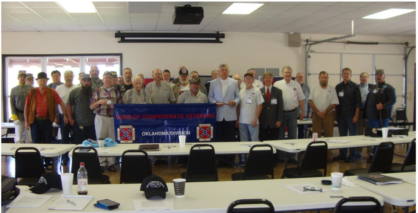
2019 Oklahoma Division Convention Group Picture