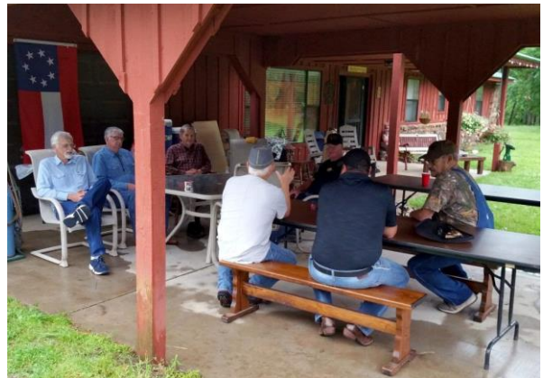
Members waiting for the rain to pass