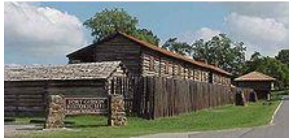
Restored Fort Gibson

The army garrisoned the fort for a time after the war, but abandoned it forever in 1890. Today, Fort Gibson is restored to its appearance during its heyday and is part of the State of Oklahoma's park system.