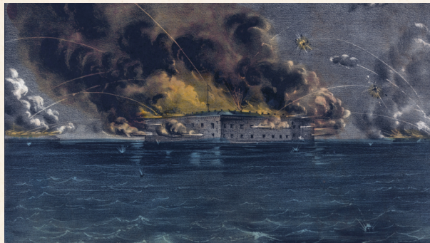
Bombardment of Fort Sumter

“Carpetbaggers” came South to take advantage of the people by raising property taxes so high that the farmers could not pay them. Then, the property was auctioned off to the highest bidder. These Yankees bought property for a fraction of what it was worth, and kicked off the former owners. This theft was common and widespread. Many blacks and whites suffered abuses from the Union League. This was a terrorist organization that would beat those who refused to vote for the Radical Republicans. Since there was no law and order for the Southerner, they took matters into their own hands and formed the original KKK, which had white and black members. They would fight against the terrorists, and over a period of time, the Union League backed off and the original KKK was disbanded. You should know that the original KKK was a good and necessary thing. It was NOT the same thing as the KKK of today.